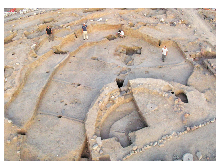
Figure 4 Wadi Faynan 16, one of the world's first large public buildings, built about 11,600 years ago, with tiered benches around a central space.

Anthropological research affiliated to CBRL has also examined the local Bedouin populations in light of the UNESCO proclamation of Bedouin 'Intangible Cultural Heritage', where an existing knowledge of the economic