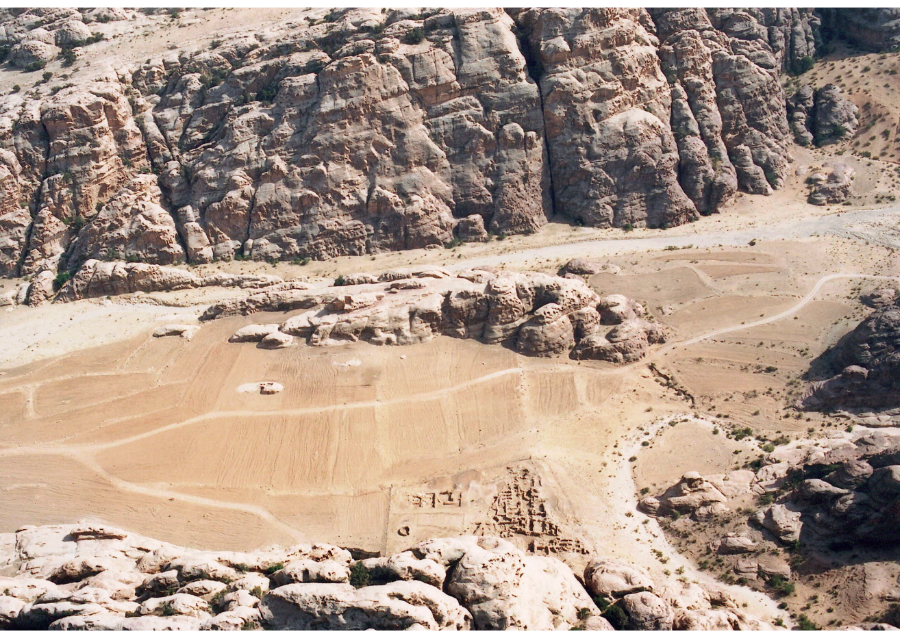
Figure 3a Beidha: aerial view.