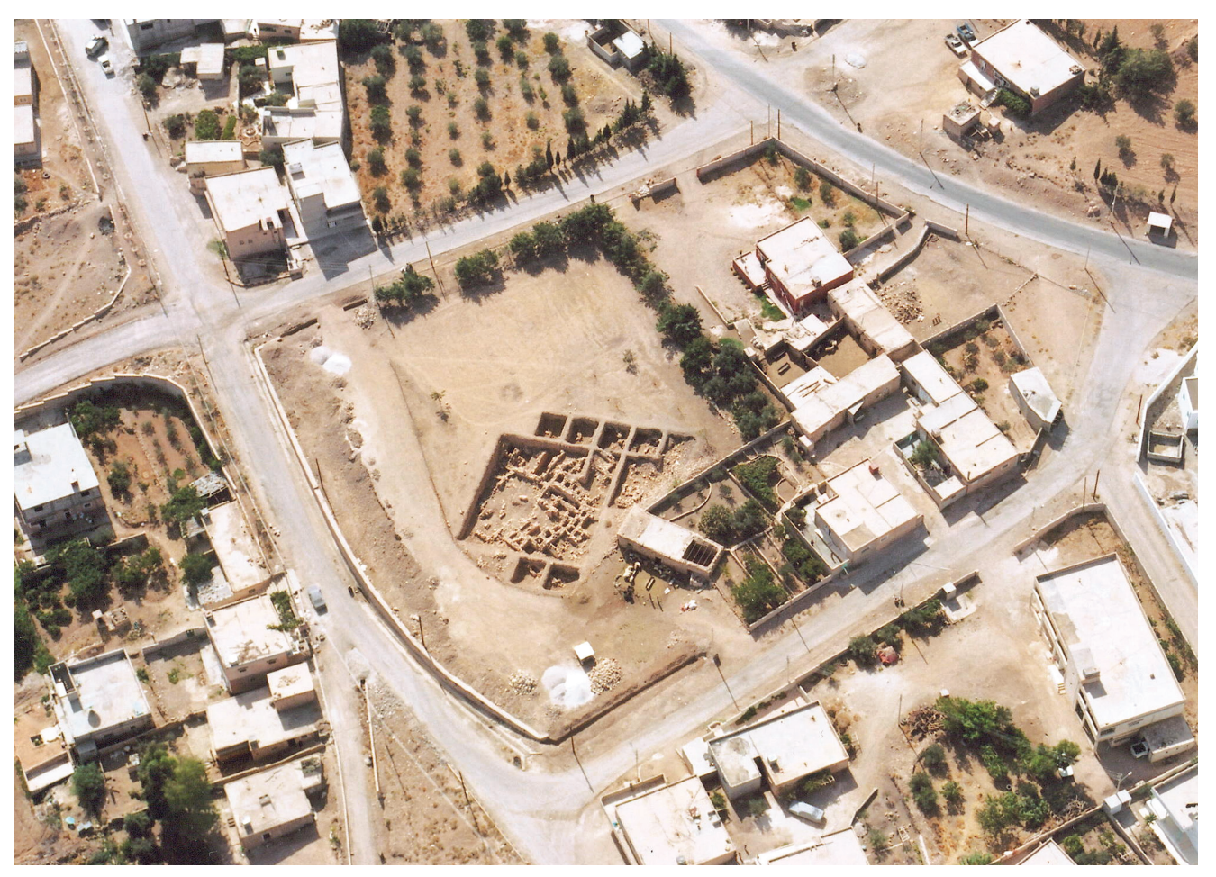
Figure 5 Basta, a large Neolithic site from 9,000 years ago, almost urban in character with densely packed multi-storey buildings.

anthropological studies have established strong connections with the local community, and the recent studies provide data on the benefits that the community receives from archaeology.