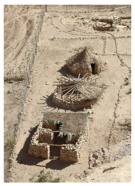
Figure 3b Beidha: experimental reconstruction of Neolithic buildings.