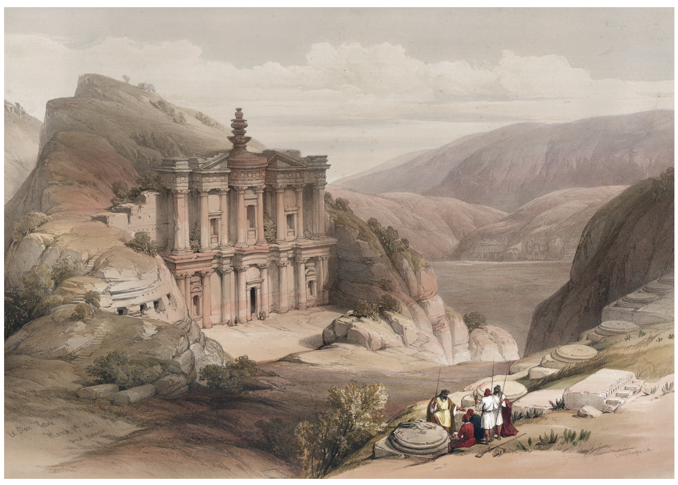
Figure 1 The Bedouin appear prominently in this 1839 painting of El Deir, Petra, by David Roberts.