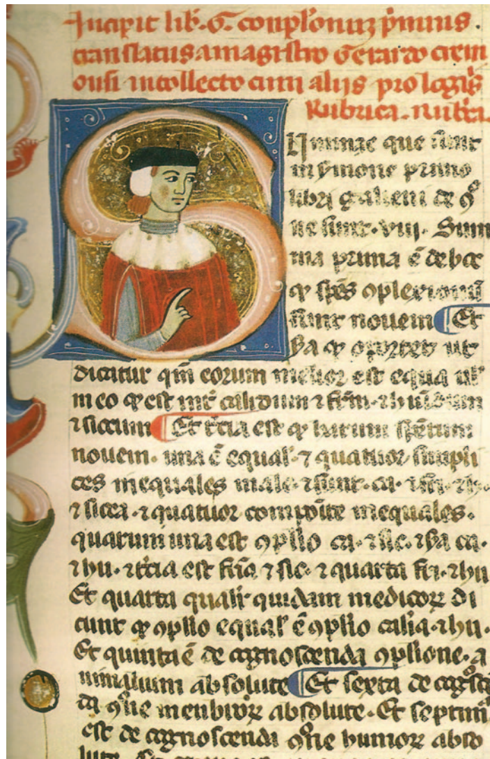
Figure 2. A medieval manuscript of the Latin Galen.

Hippocrates was one of the ancient authors whose ideas Galen thought essential knowledge for every practitioner. In Examining the physician , Galen provided the would-