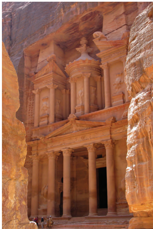
Figure 4 Petra, a 1st-century CE capital of the Nabataean kingdom. Muslims reinterpreted Nabataean ruins as the bygone cities of Thamud, an obscure people mentioned in the Qur'an, but absent in Judeo-Christian scripture. Muslims believed that a prophet Salih had been sent to Thamud, and they depicted Salih as an Arabian monotheistic precursor to Muhammad.

My aim is to write a second monograph, provisionally entitled Memory and Myth: The Muslim reconstructions of pre-Islam . For an academic, such a move from one book to another with the added need to develop a distinct theoretical method of textual analysis is a little akin to a farmer seeking multiple crops from the same field. One needs good rains and time. The British Academy grant and its three-year timeframe provides such nurturing for my research, facilitating the application of modern theories to reappraise old texts, and hopefully permitting fresh answers to the difficult questions about how myth, entertainment and polemic offered Muslims an array of avenues to explain who they thought they were.