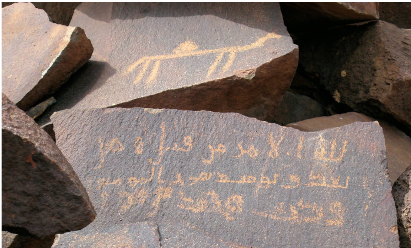
Figure 2 Inscriptions from Jabal Says (southern Syria, 7th Century CE), the text includes part of Qur'an 30:4 and is an example of the marked proliferation of Arabic writing following the dawn of Islam.

became 'Arabs' were complex, and Arabness took almost a century to gain consent as a collective identity. But these findings now enable us to appreciate better the creative energies of Islam's rise and the powerful forces it mustered which stamped major and enduring changes on the region's society and culture.