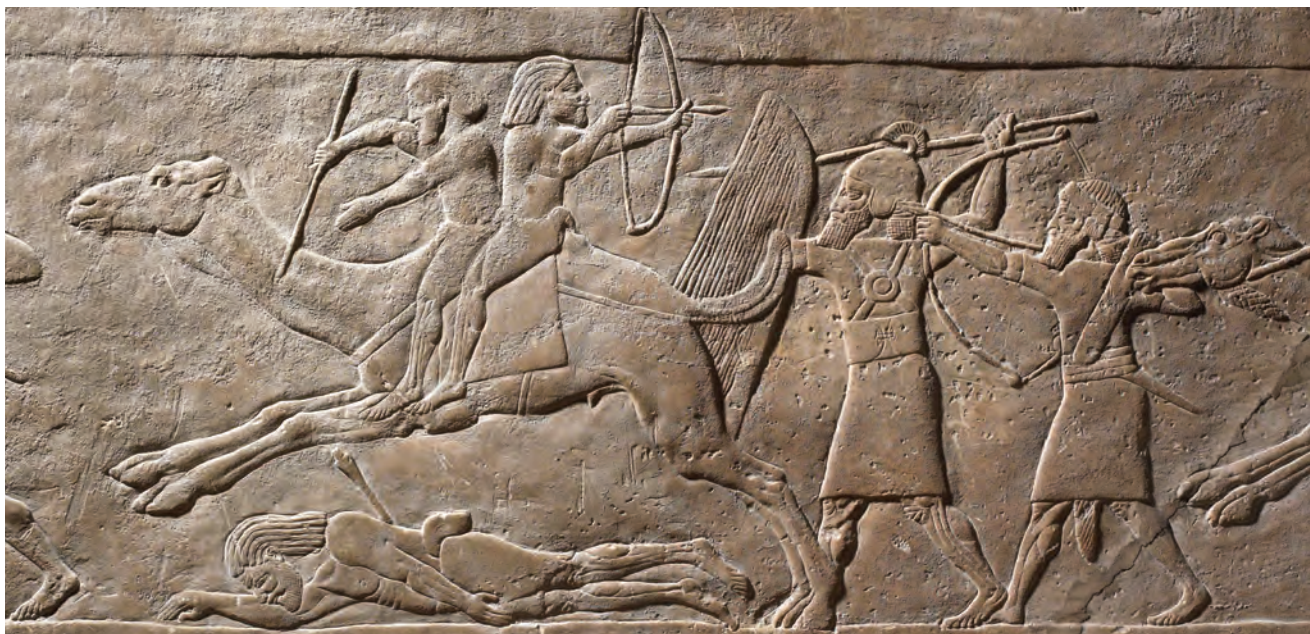
Figure 1 Assyrian wall relief depicting Assyrian combat against 'Aribi' (reign of Ashurbanipal 668-627 BCE).

world is much beholden to Hellenistic heritage: a Greek lens is often grafted onto the eyes of our intellectual enquiries; but taking classical Greeks at their word has downsides, as ethnographers have recently found. The Greeks were fond of marshalling stereotypes to label distant populations whom they little understood, and as a result, they inaugurated one-dimensional images of, for example, 'Celts' and 'Berbers' alongside 'Arabs' to epitomise vast groups of people whom they classified as 'barbarians'. Modern groups redeployed Greek archetypes of Celts and Berbers to underwrite manifold nationalist discourses from Ireland to Algeria, but scholars now radically deconstruct former assumptions about ethnic identities and move beyond Greek testimony to reconstruct ancient history. Consequently, Celtic and Berber origins are much revised today, yet the idea of 'Arabs' has mostly escaped critical scrutiny.