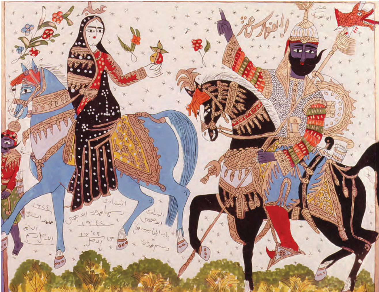
Figure 3 The tales of 'Antar and 'Abla have enduring popularity: they are now frequently illustrated, and have even been serialised for Arabic television audiences. Image: 20th-century painting on glass by Abousoubhi Tinawi; © The Art Archive/Alamy Stock Photo.