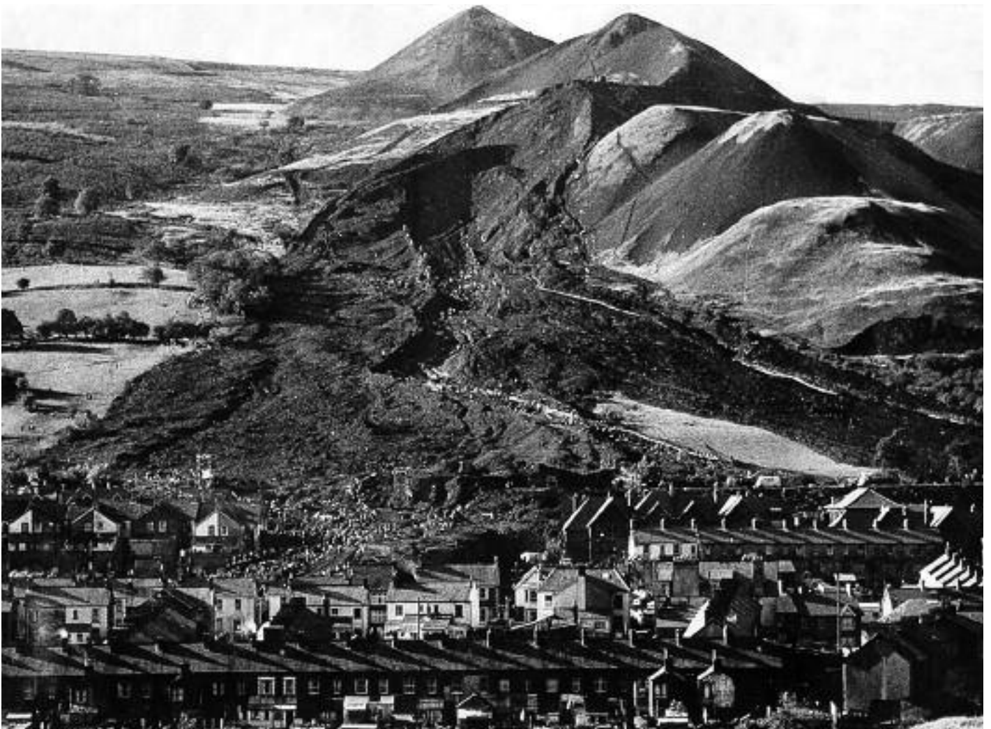
Figure 1: The 1966 disaster when a tip of coal waste slid onto the village of Aberfan in South Wales.

The Rt Hon. Lord Robens of Woldingham, a former trade unionist and Labour politician whom the Macmillan government had appointed Chairman of the National Coal Board, arrived 36 hours later, having first