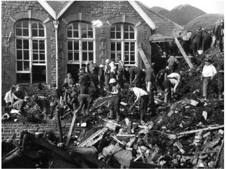
Figure 2: Rescue workers digging outside Pantglas Junior School, in which 109 children and five teachers died.

For the National Coal Board, through its counsel, thus to invite the Tribunal to ignore the evidence given by its Chairman was, at one and the same time, both remarkable and, in the circumstances, understandable. Nevertheless, the invitation is one which we think it right to accept.