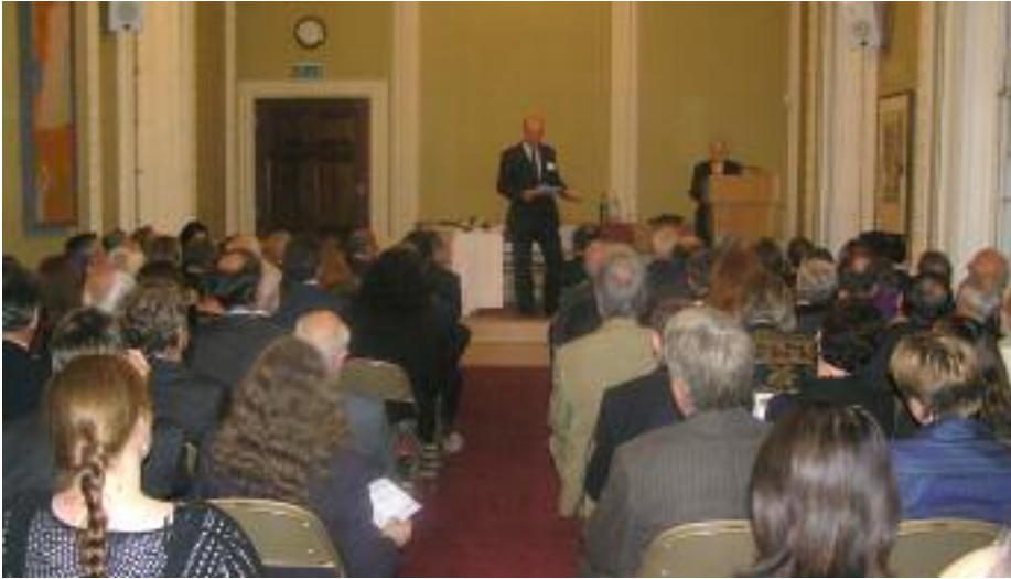
Figure 4: Newly elected Fellows of the British Academy are welcomed to the Academy, September 2008.

Partly because the idea was too mind-stretching; partly because it is always difficult, in a large organisation, to prove that a directing mind ( mens rea ) was behind a piece of criminal negligence. Not until the Corporate Manslaughter and Corporate Homicide Act 2007 – a forty-year-late response to Aberfan and other disasters – has that gap been filled.