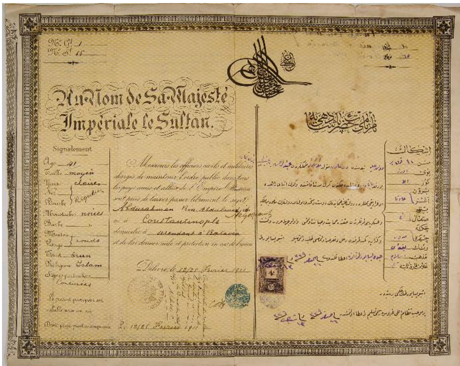
Figure 4. Passport granted by the Ottoman authorities to an Ottoman merchant resident in Batavia (modern Jakarta), dated 1911. Prime Ministry Ottoman Archive, Istanbul, HR.SYS. 563/1.

Both organisations are sponsored by the British Academy. A full list of the organisations sponsored by the Academy can be found at www.britac.ac.uk/institutes/orgs.cfm