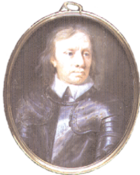
Oliver Cromwell by Samuel Cooper.

They were those of the society from which Puritanism emerged. Carlyle was never at home with the early-modern period. He knew about, and (mostly) warmed to, medieval feudalism. He knew too that the French Revolution had brought feudalism's final and inevitable destruction, and that democracy, to which he could not warm, was inevitably replacing it. It was the non-feudal and non-democratic aspects of society, from the fourteenth century to the eighteenth, that perplexed him. He knew from Scottish sociology about the stages of social development. He approved of the energy, industry and ingenuity with which communities advance their social organisation and economic resources. He accepted, what in recent decades had become an orthodoxy, that the English civil war had been in some way related to the rise of a commercial class. He recognised that the 'fighting' of the high middle ages had 'given place to trading, ploughing, weaving and merchant adventuring', and that that change, too, was irreversible. Yet Carlyle, who rebuked historical nostalgia, succumbed to it. Hard as he tried to bring alive the texture of the society that had produced Puritanism, its starched ruffs and fringed breeches and pointed beards, his heart lay with the frugal spontaneity of an earlier age. He yearned for the time when kings were 'raised aloft on bucklers with clangour of sounding shields'. He