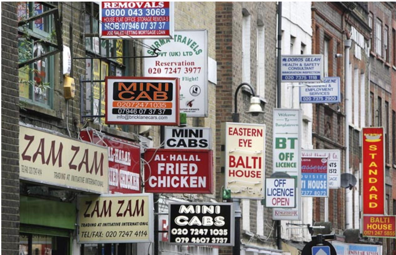
Figure 1. Brick Lane.

the history of the area and their connection with it, and also of their connection with Bangladesh. They preserve distinctive characteristics of their culture, but this cultural identity is not uncontested and there are divisions around gender, age, class and politics. They engage with wider cultures, most notably through the restaurant trade whose growth and existence has itself changed British culture – chicken tikka masala now being a favourite national dish, invented in Britain from Indian origins and now exported to South Asia. ‘Indian’ restaurants also make a substantial contribution to the UK economy.