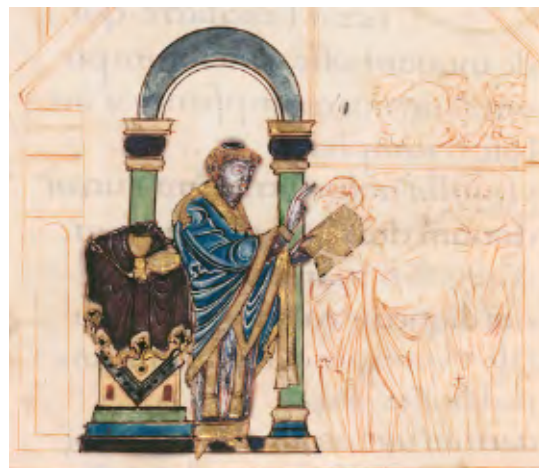
Figure 1: Bishop Æthelwold in Winchester Cathedral. (British Library Add. MS 49598)

The date of the reliquary procession advancing towards Winchester was 8 October 971: 2 the king was Edgar; the saint Swithun. The saint's remains had been exhumed from a sepulchre outside the west door of the Old Minster by Bishop Æthelwold (Figure 1) on 15 July 971. From