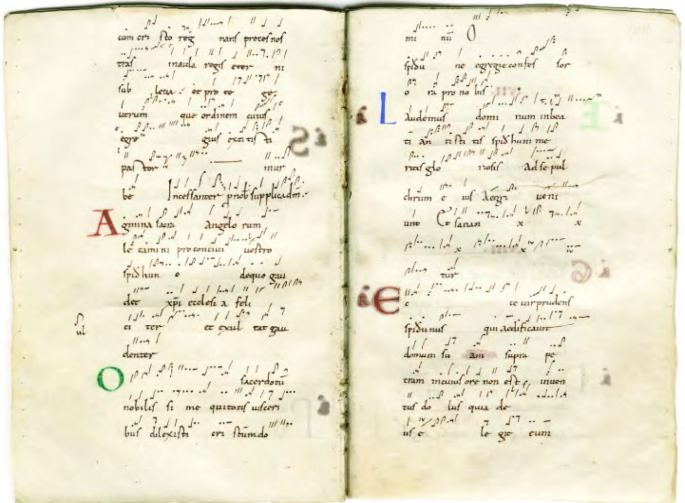
Figure 2: Organa for office chants in honour of St Swithun. Approximately full size (CCCC 473 fols 187v–188r)

These compositions by Winchester monks in honour of Swithun form part of a large repertory of new liturgical compositions collected in a small (but thick) book made in the early eleventh century at the Old Minster: many of these pieces survive uniquely in Cambridge, Corpus Christi College MS 473. Three kinds of new composition have been recorded here. A repertory of tropes for the whole liturgical year consisted of newly-composed phrases which could be inserted into the older Gregorian chants: these extended, elaborated and elucidated the standard church chants. For the mass Introit on Swithun’s feast, for example (Figure 3), instead of beginning ‘The Lord established a covenant of peace with him’, the Winchester monks sang ‘Behold the day, venerable through the accomplishments of our great patron saint, who accordingly was a joyous splendour among the people: The Lord