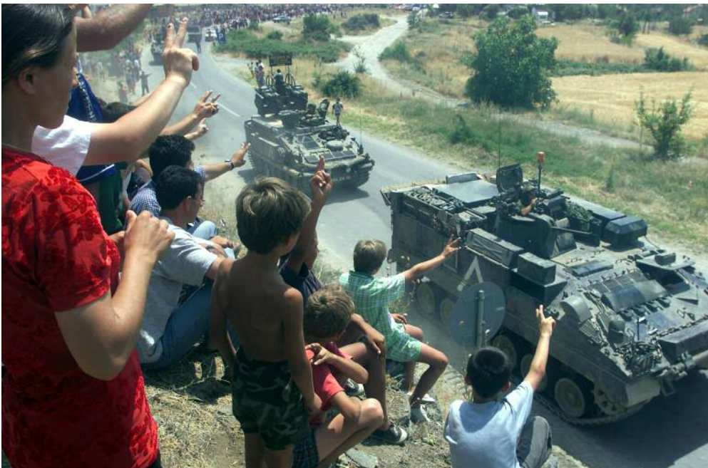
Figure 1. Warrior Armoured Personnel Carriers of the Irish Guards, cheered on by refugees from the Brazda Camp on the Macedonian/Kosovo Border, as they advanced towards Pristina, June 1999.

controversial. However, the moral principle that states have a responsibility to protect their citizens has gained traction in recent years, and has been adopted by states at the 2005 UN World Summit. While this 'Responsibility to Protect' (or 'R2P') primarily falls onto the state to which citizens belong, states have in principle recognised that the international community, acting through the UN Security Council, has a residual responsibility if states are unable or unwilling to protect their citizens.