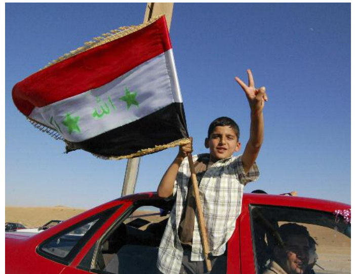
Figure 3. Time to leave: an Iraqi boy celebrates the withdrawal of U.S. troops, in Mosul, 30 June 2009.

Efforts to engineer a particular political outcome, and supporting certain local elites and leaders seen as sympathetic to an intervention's objectives, are fraught with risks and difficulties. Local actors have their own priorities and objectives, and while they may overlap with those of international interveners, they may at times conflict. This was highlighted most starkly by the recent presidential elections in Afghanistan, which returned the West's partner, President Hamid Karzai, to power, but because of pervasive electoral fraud fundamentally undermined the local and international legitimacy of the intervention. In the worst case, such a policy can deepen divisions within the country and lead to conflict – as in Iraq. Here, the attempts of the US and its allies to entrench a pliant exiled elite in government through elections exacerbated the political and social dynamics that contributed to civil war after 2005. The electoral system contributed to the polarisation of Iraqi politics along ethnic and sectarian lines, and