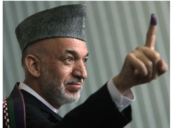
Figure 4. Afghan President Hamid Karzai holds up his inked stained finger after voting in the presidential election in Kabul, 20 August 2009 – an election marred by electoral fraud which led to the invalidation of votes from over 200 polling stations.

branches of the British state in Malaya, and could direct them in a more co-ordinated fashion in its counterinsurgency efforts, or even some UN operations, such as the international administration of Eastern Slavonia from 1996 to 1998, where both civilian and military command were exercised by a single person.