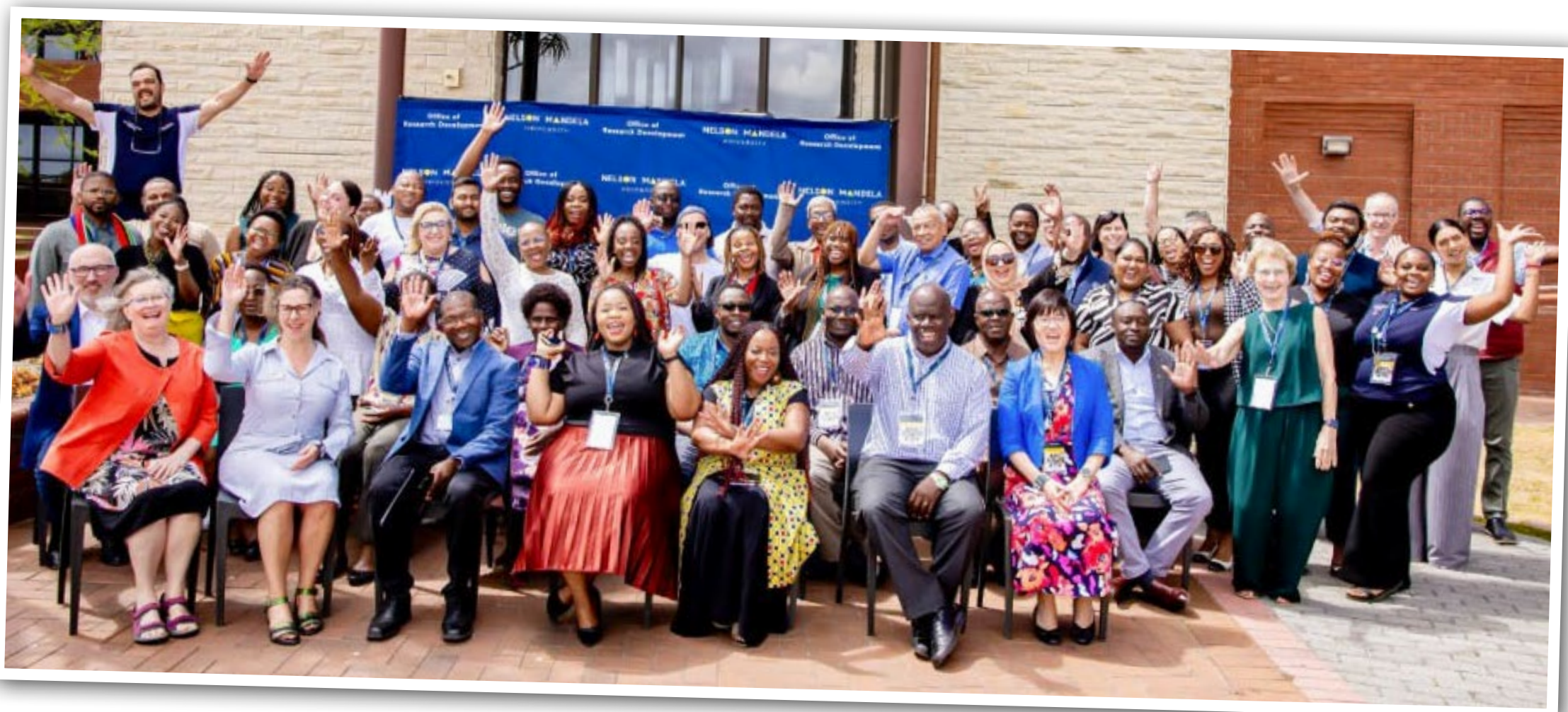
Madiba Nexus International workshop on balancing equitable partnership, January 2026