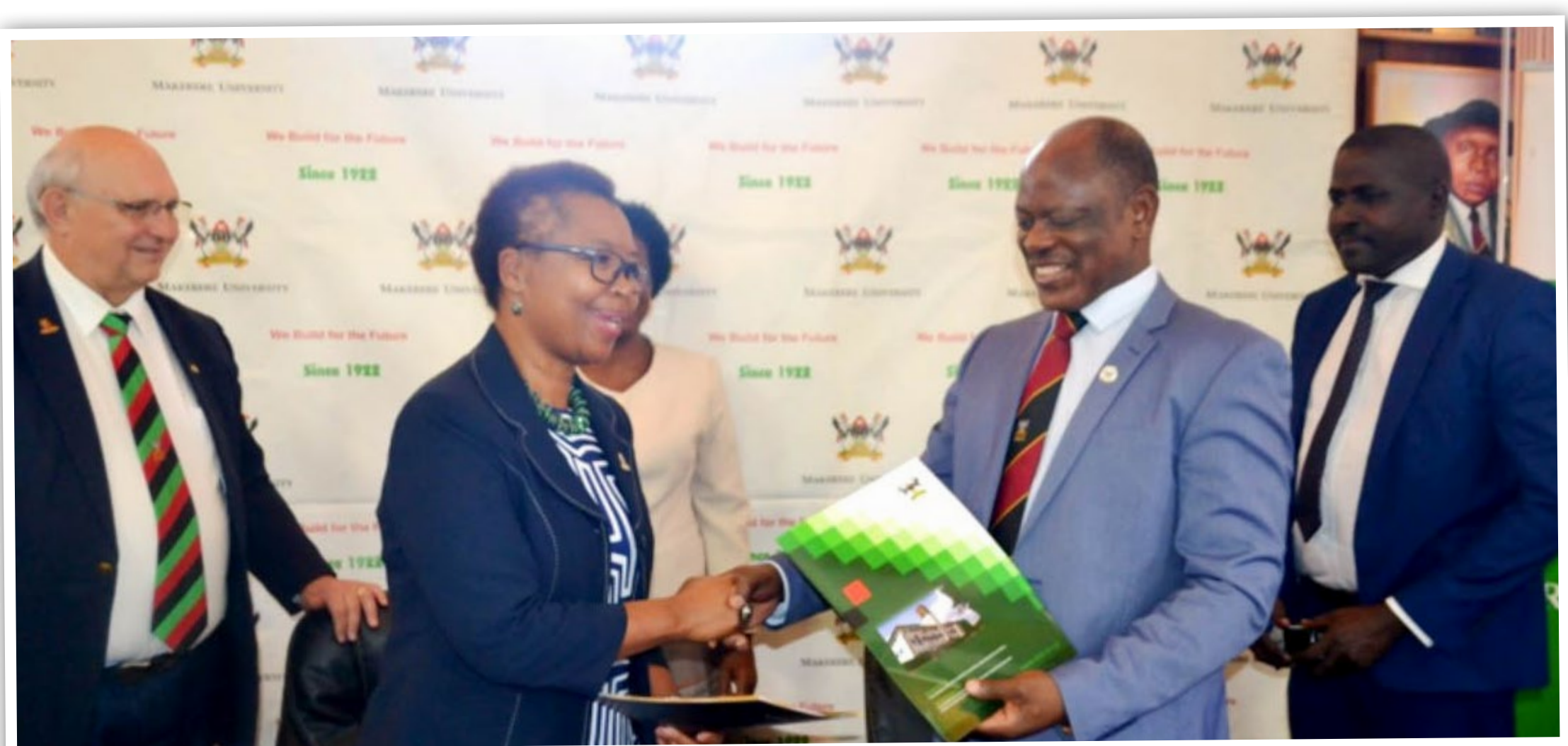
Makerere University and Nelson Mandela University sign an MOU to strengthen collaboration in addressing Africa's development and health challenges.