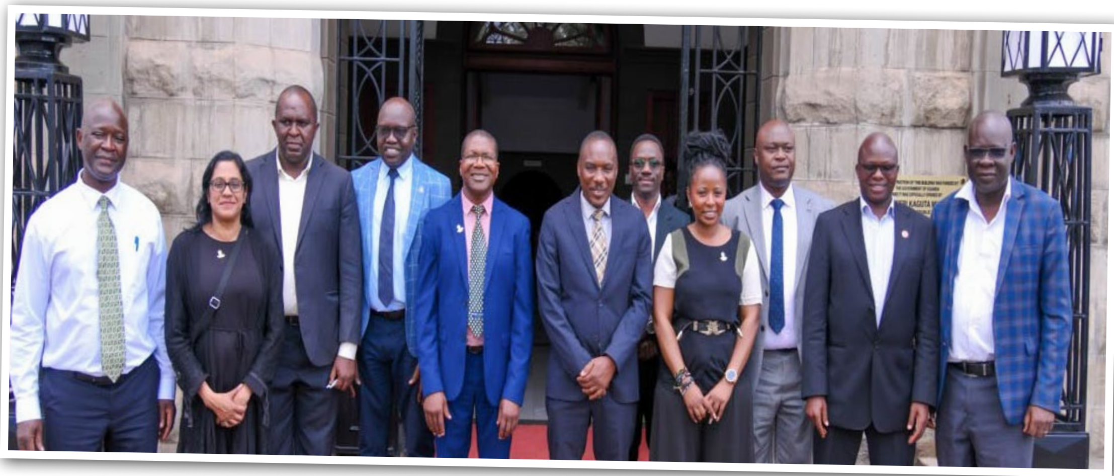
Makerere University-Nelson Mandela University Collaboration

Equitable research partnerships are central to the success, impact, and sustainability of global research initiatives. As African universities increasingly engage with regional and international partners, issues of trust, communication, power asymmetries, and leadership structures become critical determinants of partnership effectiveness. Our experiences at the Makerere University Lung Institute (MLI) and Nelson Mandela University (NMU) position us uniquely to reflect on how well-designed partnerships can advance research delivery, strengthen institutions, and build long-term collaborative ecosystems.