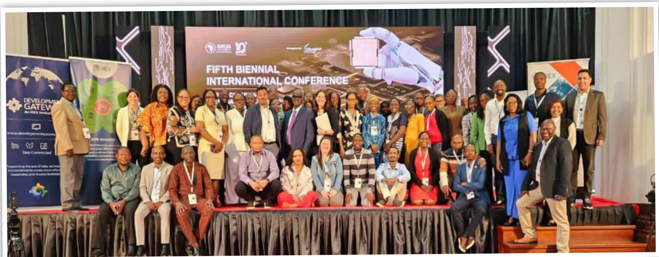
IREX UASP Alumni Network Launch, October 2025