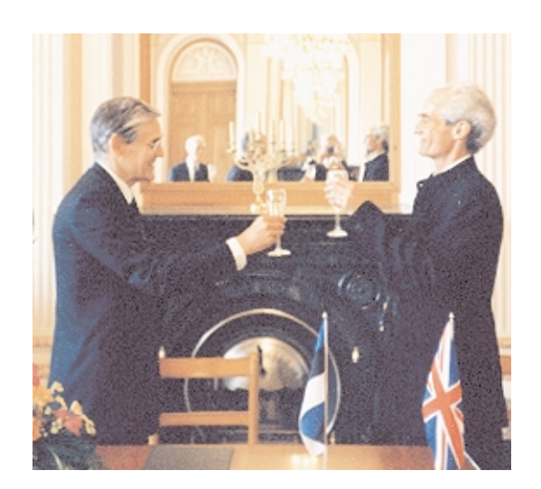
The President of the Estonian Academy of Sciences and the Foreign Secretary toast future British-Estonian relations.

is clear, however, that the new-found ability of the Overseas Policy Committee to fund a variety of joint activities presents a real chance to diversify the Academy's role, to promote the research of younger scholars, and to forge new relations where they can be of real value.