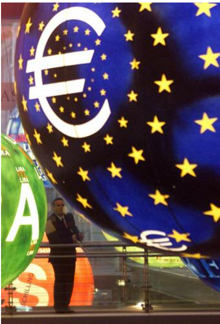
Figure 2. Preparations in Paris for the launch of the euro in January 1999. Both Britain and Denmark have an opt-out from the euro, but Denmark is in the Exchange Rate Mechanism (ERM II). Recent members of the European Union

However, the auditing of differentiated integration in the workshop showed that EU member states had been reluctant to invoke the Amsterdam and Nice treaty provisions. The widening scale and variety of forms of differentiated integration placed in question the two traditional premises. In many new policy sectors, the distribution of gains and costs from integration were asymmetrical in ways that made it rational for some states to prefer non-commitment.