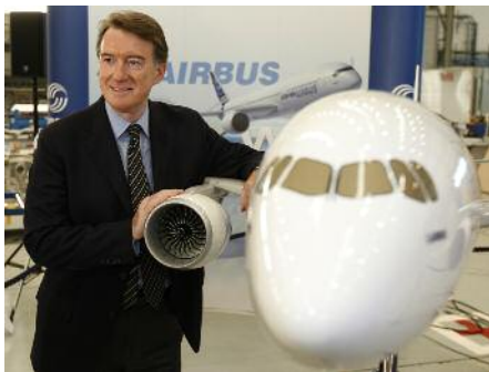
Figure 1. Lord Mandelson poses with a model of an Airbus A350, 14 August 2009. Airbus has production sites across Britain, France, Germany and Spain.

In addition, various territorial forms of differentiated integration have evolved. They include the 'special' Franco-German relationship, the Baltic, the Benelux, central Europe, the Mediterranean and the Nordic areas, and cross-national regional co-operation in Alpine Europe. These are associated with the building of regional identities.