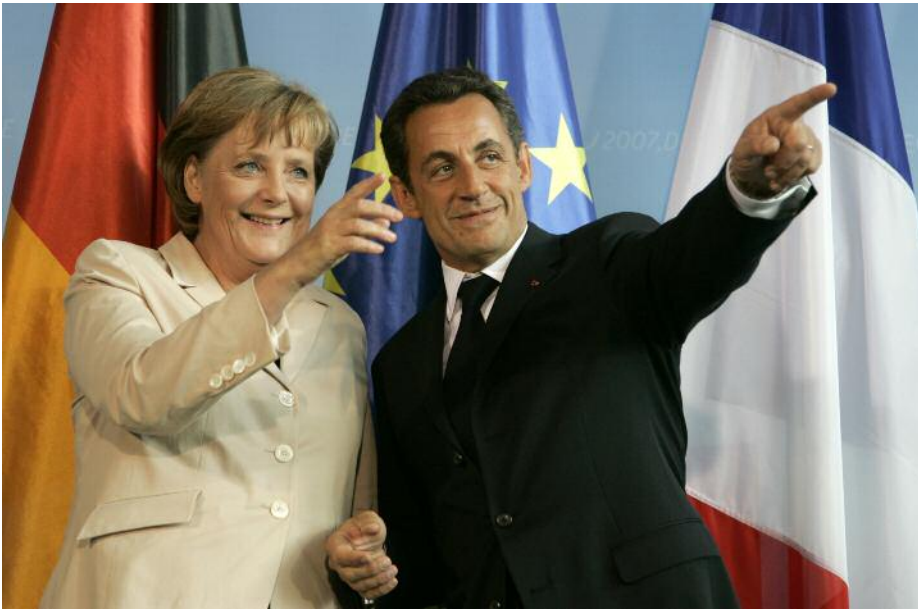
Figure 3. France and Germany remain a driving force at the heart of European integration. On 16 May 2007, within hours of formally assuming office, President Nicolas Sarkozy met Chancellor Angela Merkel in Berlin, to underscore the importance of Franco-German ties.

The shift from a functional type of explanation for differentiated integration towards political explanation suggests that the EU is shifting from a predominant pattern of ‘moderate’ differentiation, essentially exceptional and temporary, towards more examples of ‘polarised’ and entrenched differentiation. This shift reflects the expansion of ideological space in the politics of European integration on the two dimensions of market/social and of integration/sovereignty. In the process Euro-sceptic opinion has hardened at the extremes. In this changing context, some states become less ‘coalitionable’ as their political elites seek to exploit or contain electoral threats from Euro-sceptic opinion. The UK is a prime example, but far from being a lone one.