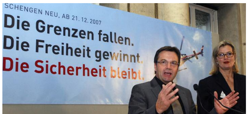
Figure 4. A press conference in Vienna in December 2007 to mark the expansion of the Schengen Area to include nine new European countries – including Austria’s neighbours the Czech Republic, Slovakia and Hungary. The poster reads: ‘Schengen new from 21.12.2007. Borders fall. Freedom wins. Security remains.’

For this reason the traditional drivers have retreated from talking about institutionalising a formal ‘core’ Europe, a topic that gained high profile in the mid-1990s (over EMU), in 1999–2001 (over eastern enlargement), and in 2003 (over the second Iraq War). Pressing ahead with such ideas, typically using the Euro Area as its nucleus, threatened their capacity to retain their ‘centre positioning’ in the integration process. The problem was not just an escalation of conflicts with outsiders. It also involved enormous differences amongst euro insiders over such matters as defence, social policy and business taxation. Instead, an informal ‘core’ of states was emerging. They shared membership across a range of