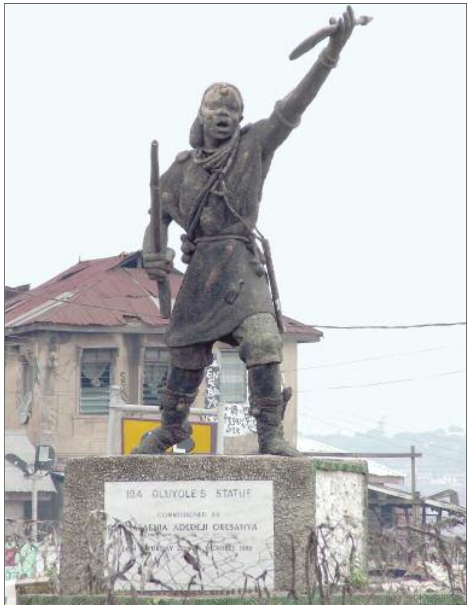
Iba Oluyole's statue. Oluyole was one of the great Ibadan kings. His statue stands next to Mapo Hall and overlooks Iba market

Nigeria. 4 The methodology of the Ibadan school was not confined to Nigeria, and nor were the historians only African, but it is clear that at least initially in the tracing of the historical past for the nation, the Ibadan school made a concerted attempt to overcome the limitations of colonially constructed indigeneity within Nigeria. The clarity of Ibadan however was to recognise that that indigeneity was also supplemented by other perspectives and these, such as the study of the formation of elites and role of the Christian missions in the construction of the Nigerian nation, became as much a part of the historical construction of the nation as the more formal histories.