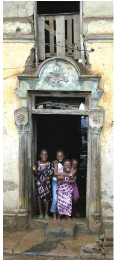
A doorway in the Old city. Note the Afro-Brazilian style of architecture

town. 2 It was one of several cities, including Abeokuta and Oyo, founded in the aftermath of the destruction of the major Yoruba town (and centre of the dominant Yoruba empire), Old Oyo (Oyo Ile), by the adjoining northern Fulani Empire in a jihad led by Alim al Saliah in 1835. Each of these ‘new’ cities developed in unique ways – Oyo claiming inheritance of government structure and status from the old central empire, Abeokuta developing as a conglomeration of four communities, each with their own titles and trading corporations, and Ibadan as a refugee camp that eventually developed the most feared army in southern Nigeria. Ibadan’s militarism was competitive and individualistic, status and authority was gained by individual warlords who maintained armies and retinues through the constant provision and distribution of wealth gained from military