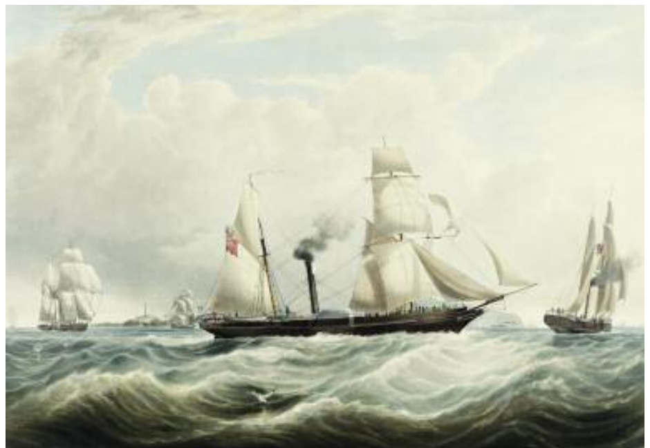
Right: The Niger Expedition ...off Holyhead... Aug–Oct 1841. HMS Albert, also shows Sudan and Wilberforce.