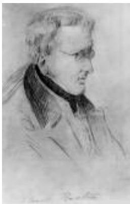
Left: Sir Thomas Fowell Buxton, first Baronet (1786–1845) , by Benjamin Robert Haydon, 1840. National Portrait Gallery, London