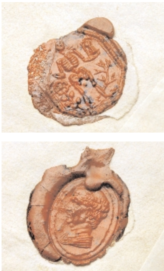
Figure 1. Seals on letters from Boyle in Early Letters B1, 90 (top) and 99.

are transcribed and all postmarks and seals recorded. The latter are a feature of epistolary exchange in the period that has often been overlooked in editions of correspondence, yet they provide significant information. In Boyle's case, for instance, he used a variety of seals, not only heraldic ones but also classical motifs and symbolic devices such as a memento mori showing a skeleton with an hour glass.