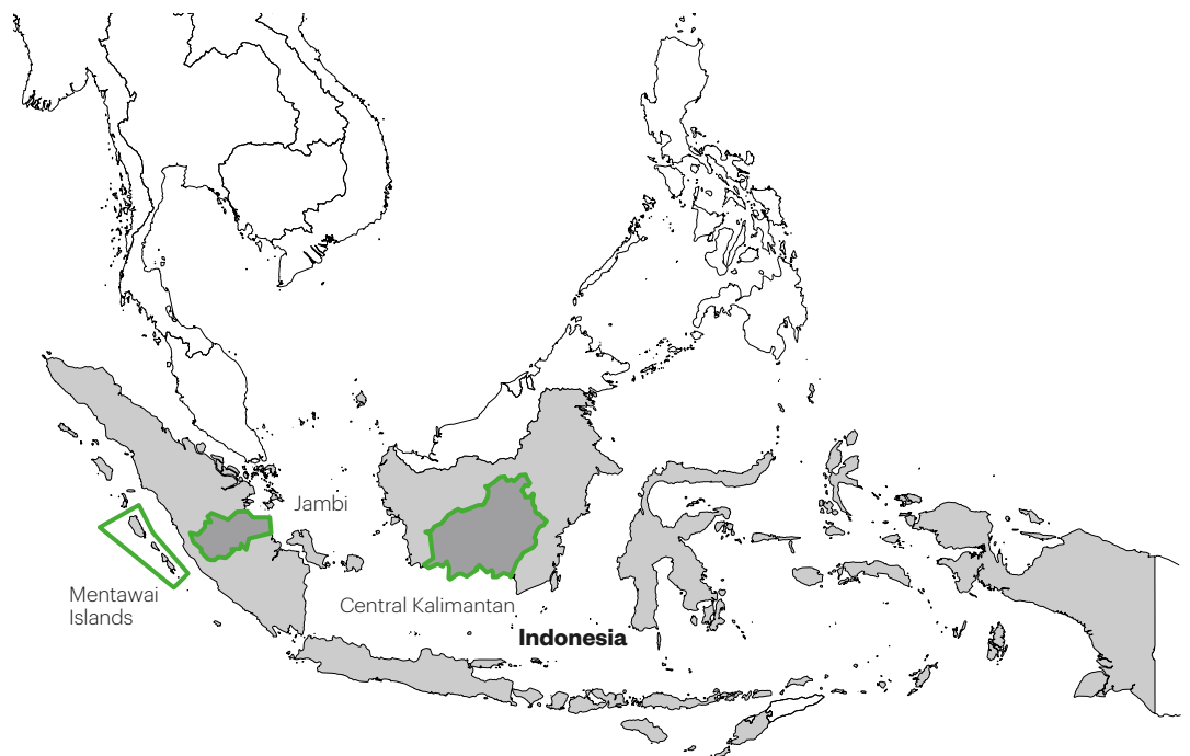
Figure 2: Locations of three ForestScape case studies

Based on the findings from this research, the following recommendations to achieve just transitions to decarbonisation in the agriculture and forest sector are proposed: