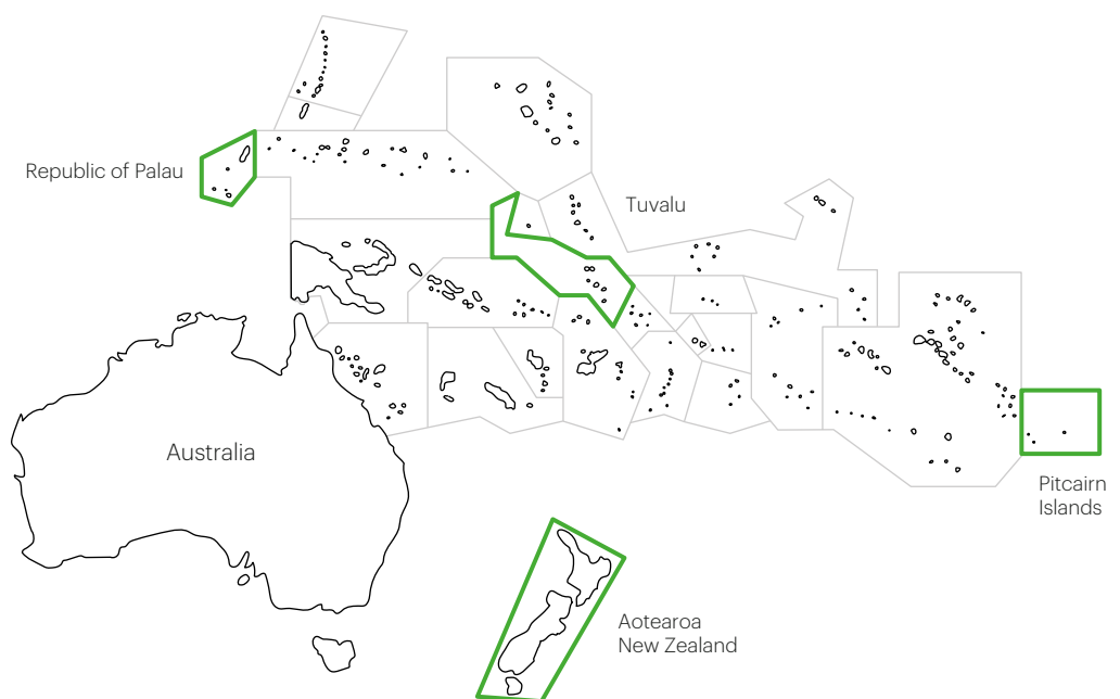
Figure 3: Map of Oceania and case study locations

Prior to COP21, Pacific nations strengthened their commitment to energy transition action and sustainable energy goals within their nationally determined contributions (NDCs). This action aimed to put them at the forefront of responses to global warming. The pursuit of energy security through renewable energy makes sense given the impacts of climate change in the region. 13 out of 14 Pacific Island Countries (PICs) have quantified renewable energy targets in their NDCs (nearly 2GW of renewables capacity) supported by the Regional NDC Pacific Hub.