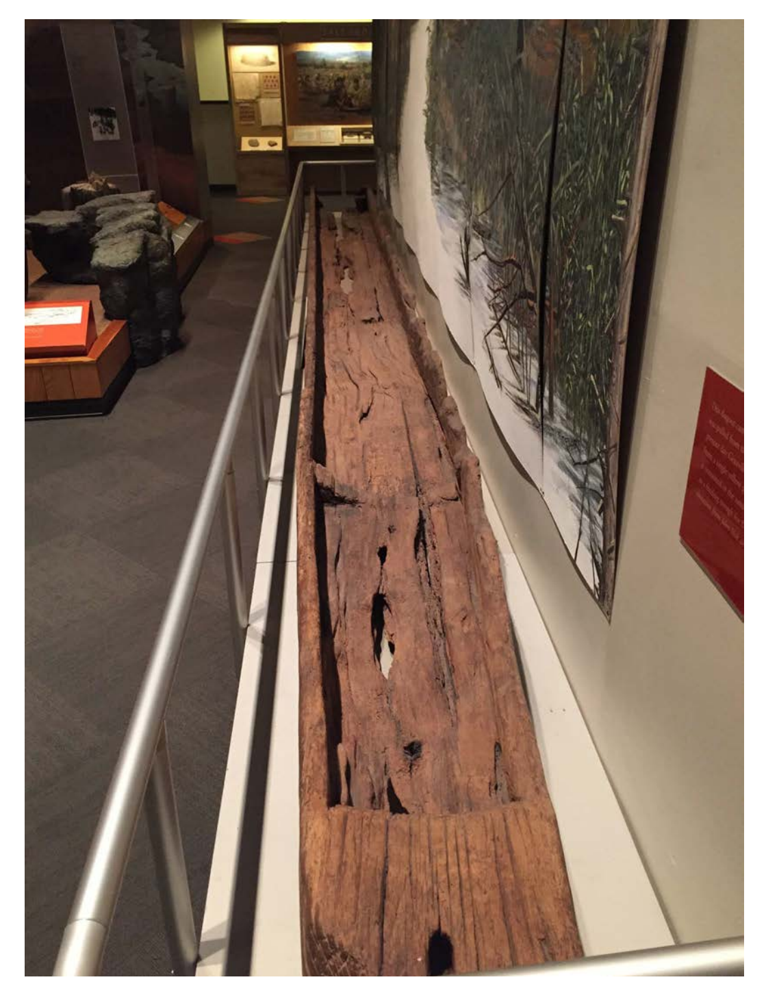
Figure 4. A rare archaeological find, a canoe unearthed in Cherokee country and housed at the Tennessee Division of Archaeology, Nashville, Tennessee.