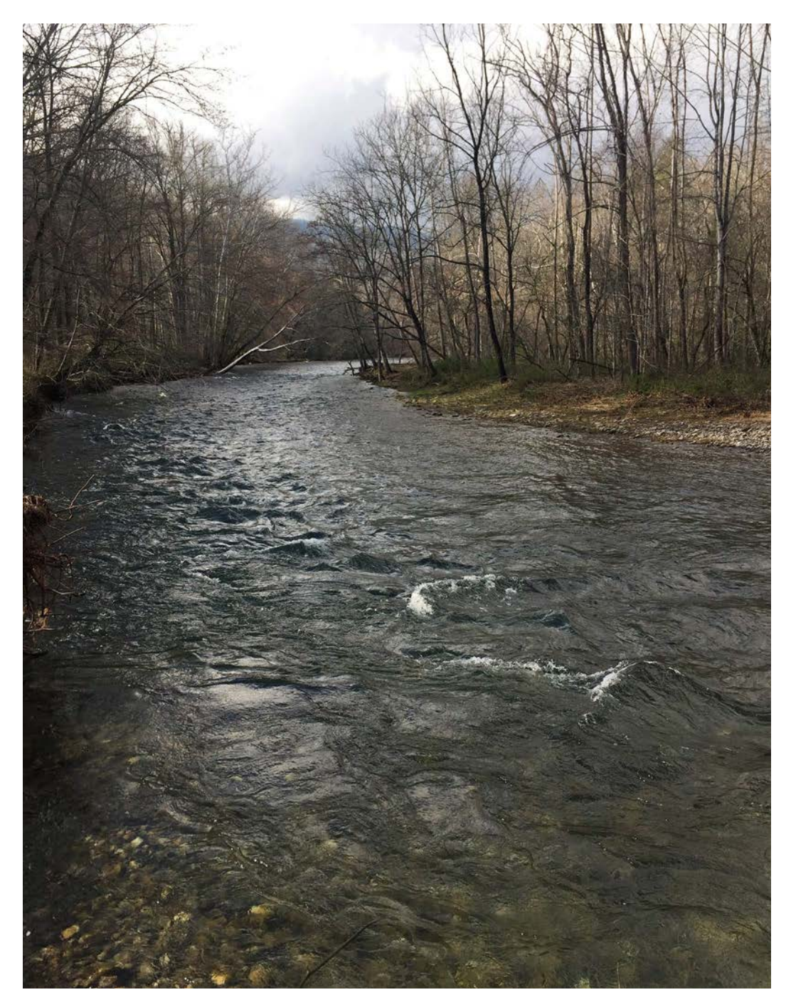
Figure 2. The Oconaluftee River begins life high in the Appalachians at Newfound Gap near the Tennessee-North Carolina border. It flows westward and eventually connects with the Tuckasegee River. The cool, shallow waters of the 'Luftee' flow through the centre of the Qualla Boundary, home to the Eastern Band of Cherokee Indians.