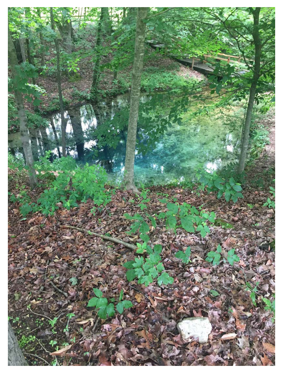
Figure 5. Blue Hole Spring, a gateway to the Underworld.