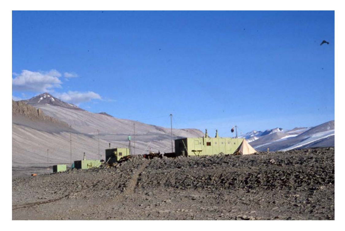
Figure 1. Vanda Station in early 1980s.

'traditional' Antarctic culture. Female scientists in particular did not always feel comfortable visiting the station, and by discouraging talented scientists, the culture of Vanda in some ways became an obstacle to doing state of the art science.