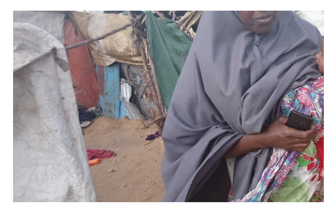
Figure 1. A female resident of a displaced people's camp in Mogadishu holds her baby and phone. Photo by Mano (July 2018).

Academic literature on migrants' use of ICTs tends to focus on refugees en route to the Global North. Although studies of the impacts of ICTs for marginal populations in the Global South are increasing, research on the use of phones by forced migrants on the African continent is limited. This article's empirical material was generated in a research project that explored links between urbanisation and displacement<sup>2</sup> from the perspectives of displaced people in three cities in Somalia: Baidoa, Bosaaso and Mogadishu.<sup>3</sup> It draws from 79 narrative interviews—conducted by researchers from Somalia and the authors between 2017 and 2018—with residents of multiple urban settlements in which predominantly displaced people reside. Thirteen semi-structured interviews were also held in those cities with so-called 'gatekeepers', host communities, humanitarian workers and local government officials. Additionally, the researchers used 'photovoice', equipping 30 people, ten in each city, with camera-phones to document their everyday lives.<sup>4</sup> Photos used in this article were taken by these research participants. Drawing on research findings on migration to Europe, the interviews included questions on access to mobile phones and ICT infrastructure during displacement and resettlement. The interviewees confirmed widespread use and highlighted the everyday