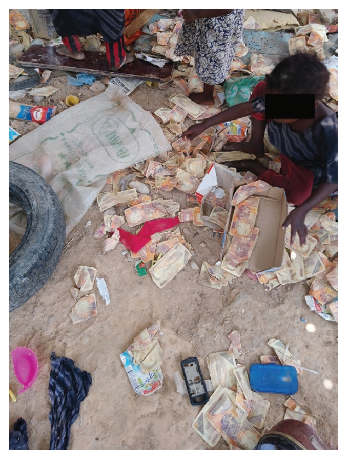
Figure 2. Children in a resettlement area for displaced people in Bosaaso play with 'worthless' paper currency printed by a previous administration. Photo by Nuurow (July 2018).

around 2002 and grew out of earlier infrastructure developed by the Al Barakaat remittance company (Hagmann & Stepputat 2016: 10; Lochery 2015; Marchal 2002). Al Barakaat operated until 2001 when its funds were frozen by the US following accusations of links to terrorist financing (Lindley 2009a: 529). Today, Hormuud offers a wide range of services and is a provider of some of the lowest-cost mobile internet data in the world. In this context, mobile telephony provides a nearly ideal-typical example of the global flows that Appadurai's concept of technoscapes emphasises. Although internet access via smartphones is beyond the reach of the majority of people living at the margins of cities, basic mobile phones and mobile money were used by all interviewees. Only four interviewees, all of them elderly, did not possess a phone. However, they still used the devices of relatives or neighbours to communicate or receive money. Some interviewees reported that they had not had a phone for some time because it was broken, had been stolen or they had to sell it. They usually tried to replace it as soon as possible.