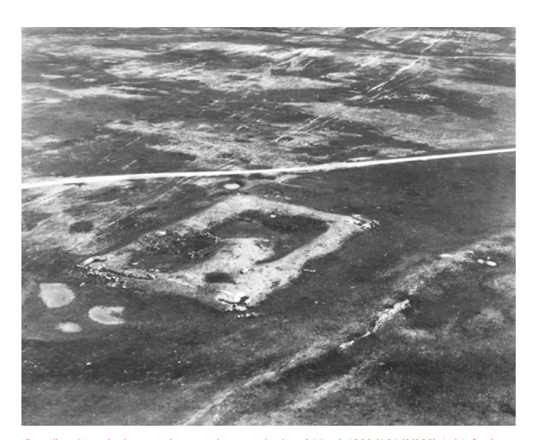
'Castellum Najm looking north-east', photographed on 8 March 1938 (ASA/3/233). In his final report, Stein wrote: 'The location of a Roman castellum at Najma ... affords the definite and historically important indication that the route ... was for a time protected by Rome as an outlying section of its Mesopotamian limes .'

From March to May, Stein continued to survey the area by plane and by car. By 4 April, he was able to report 'the discovery of 3 Roman castella which settles the previously unsuspected line of the Roman road connecting the well-cultivated centre of the Sinjar range with the great stronghold of Nisibis.' Six weeks later, he had traced the southern extension of the limes , but by now the weather had become intolerably hot, and so the project was put on hold until the crew were able to reassemble in the cooler autumn months.