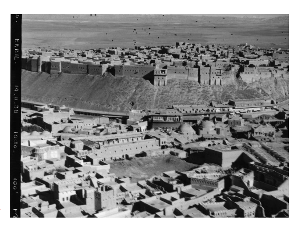
Aerial photograph of Erbil what is now the capital of Iraqi Kurdistan -Taken on 14 November 1938 (ASA/3/248).

On 1 June 1939, The Times reported that Stein had now returned to England having completed the survey of the old Roman boundary begun by Poidebard by including the sections in Iraq and Transjordan. The report revealed that, at Erbil, 'Sir Aurel Stein visited the site of the battle of Arbela, and was able to satisfy himself as to the correct position of this spot made famous by the campaign of Alexander the Great.'<sup>5</sup>