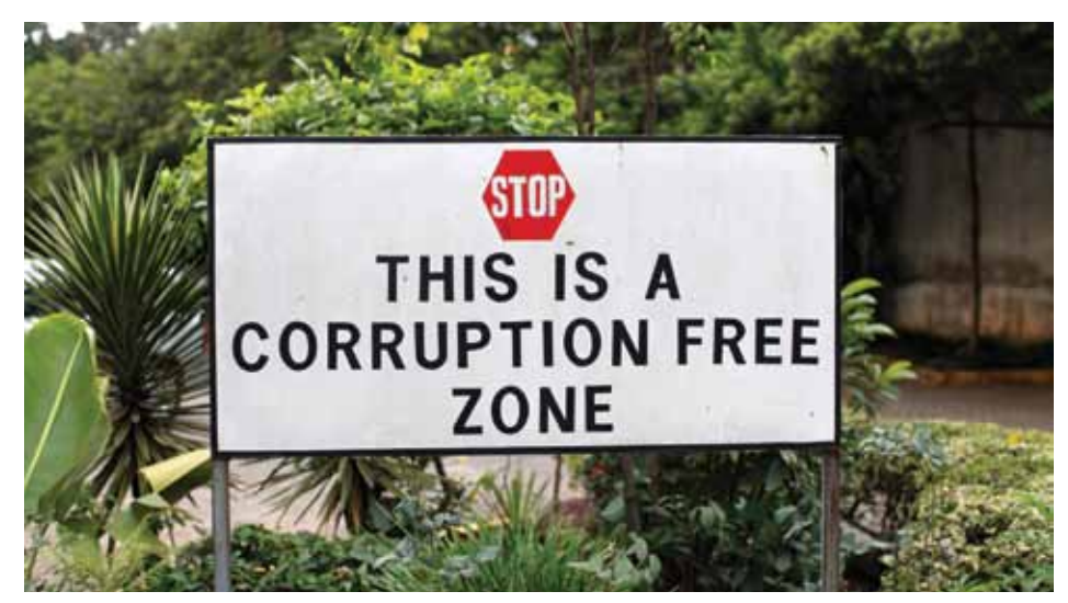
A major global anti-corruption research scheme is being run in partnership with DFID

The British School at Rome delivered the early phases of the Rome's Mediterranean Ports (RoMP) project. Funded by the European Research Council, it allows researchers to have a better understanding of the historic role played by ports in promoting the cohesion of the Roman Mediterranean during the Imperial era.