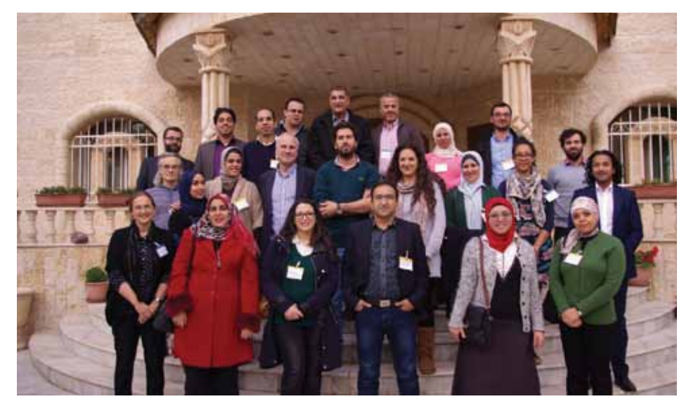
Early career scholars from the Middle East and Africa taking part in a research methods workshop at the CBRL Institute in Amman

Policy work on the EU's role in supporting research included a joint event with the Royal Irish Academy exploring EU research and innovation practices, and an expert forum on demographic change, which highlighted the contribution humanities and social sciences can make to European policy.