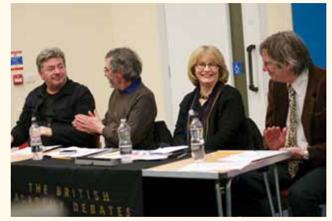
Panellists at the British Academy Debate on Faith in Newcastle upon Tyne

14,000 PROSPECT SUBSCRIBERS RECEIVED BOOKLETS SUMMARISING EACH SERIES OF DEBATES