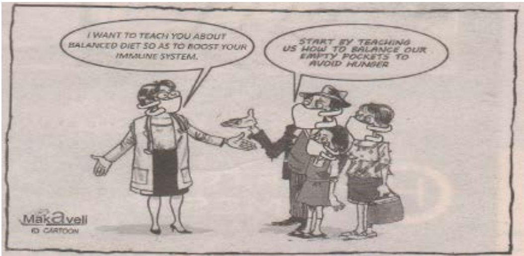
Figure 4. Makaveli, Business & Financial Times , 20 April 2020.

have appeared on signposts and billboards in public spaces across the country. Of the fifty-three cartoons published by three prominent cartoonists—Akosua, Makaveli, and Tilapia da Cartoonist—between March and July, almost half focused on health themes. In contrast to the official didactic health promotion approach, the cartoonists situated prevention messages within the structural determinants of COVID (Figure 4).