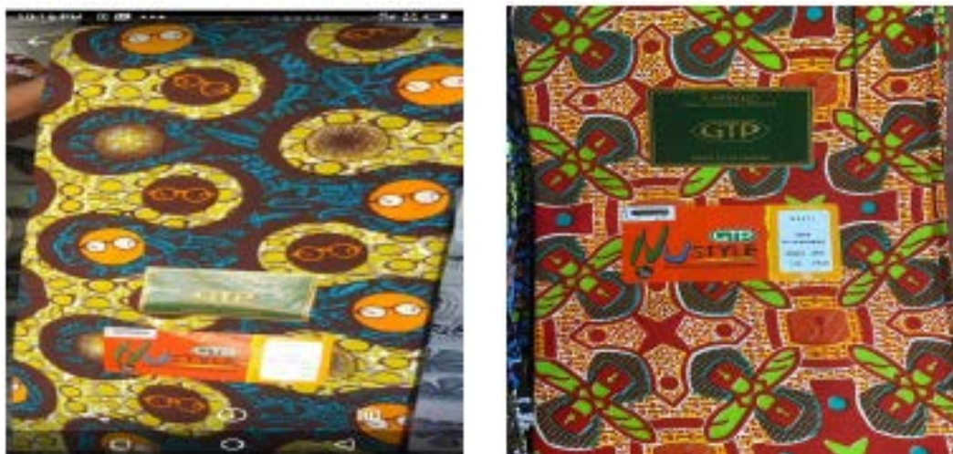
Figure 2. GTP COVID designs ‘Fellow Ghanaians’ and ‘Lockdown’.

In July 2020, Ghana Textiles Printing (GTP) launched new COVID-19-inspired textile designs. Building on a long tradition of using textiles to memorialise significant national events, the designs featured recognisable symbols of the COVID pandemic: planes for airport closures, padlocks for lockdown, the medical illustration of the coronavirus, and in what appeared to be political homage, the distinctive round eyeglasses worn by Ghana’s president Nana Akufo-Addo (Figure 2).