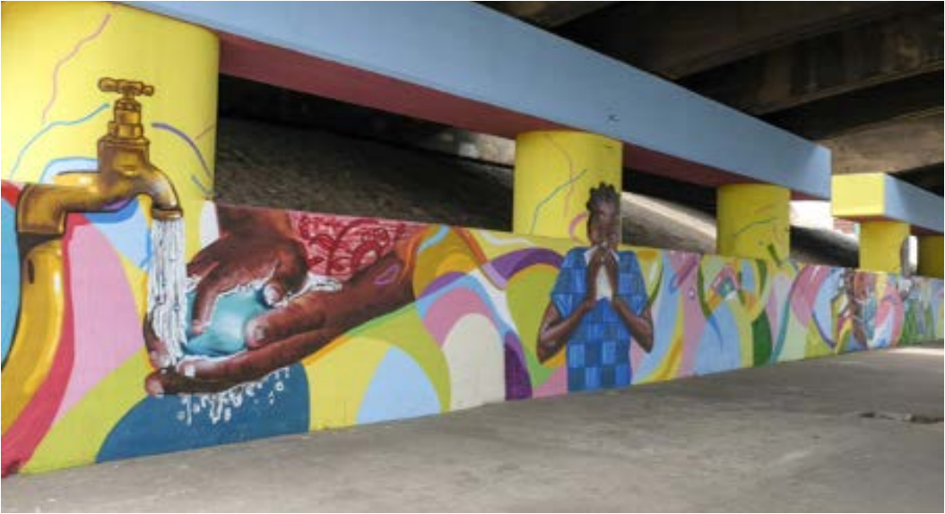
Figure 3. COVID mural painted by Ghana Graffiti Collective, Accra, March 2020.