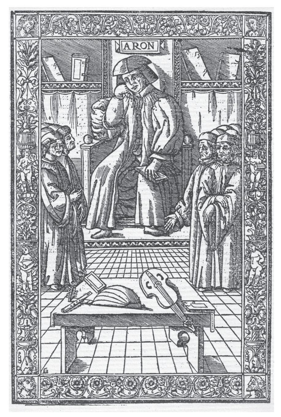
Figure 3. Pietro Aaron, Toscanello in musica (2nd edn., Venice, 1529), sig. a ii<sup>v</sup>.