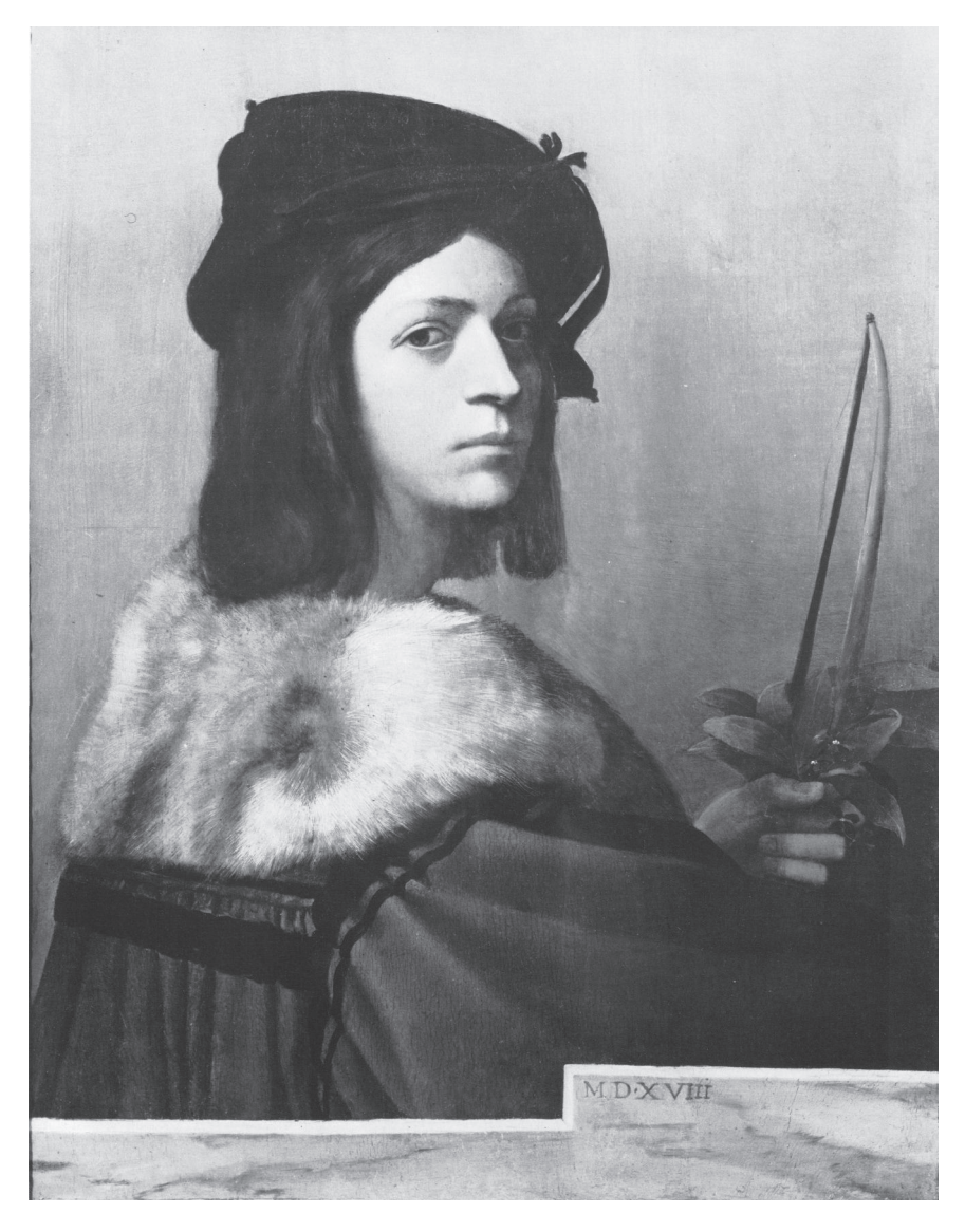
Figure 5. Sebastiano del Piombo, Portrait of a young man holding a bow. Private collection.