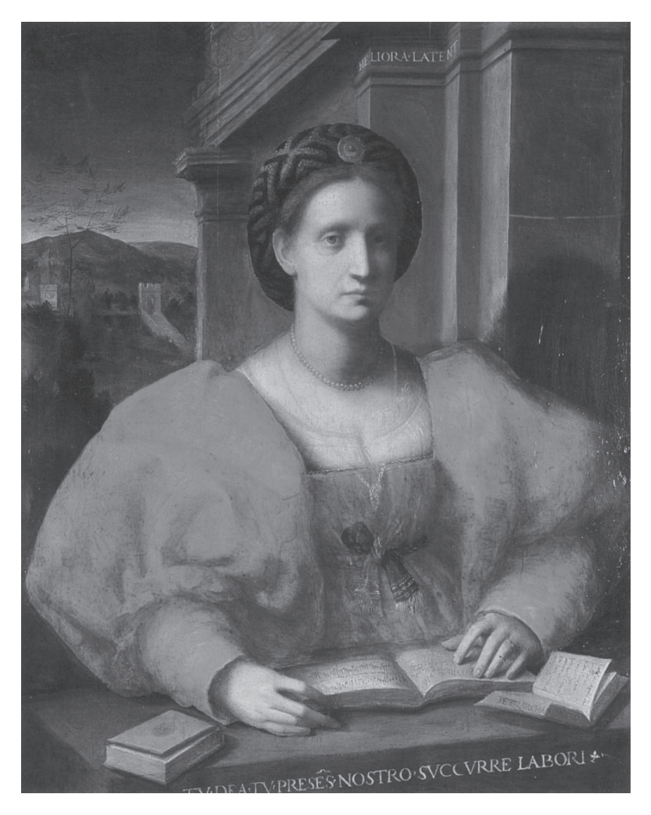
Figure 4. Domenico Puligo, Portrait of Barbera Salutati(?). Private collection; used by permission.